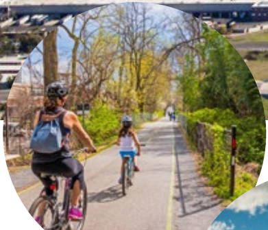
Wood Canyons Regional Wilderness Park